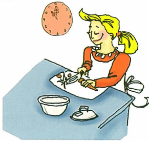
cooking lunch (not making cakes)