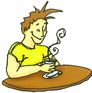
drinking coffee (not eating a sandwich)