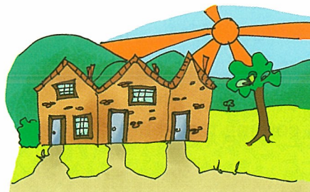
The sun / shining (It / not raining)