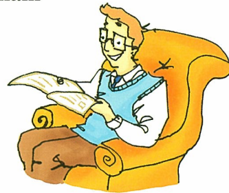
sitting in his armchair (not standing up)