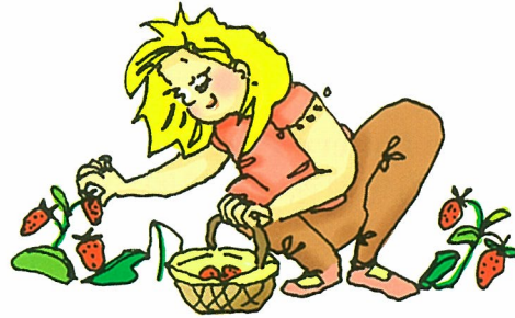
picking strawberries (not picking flowers)