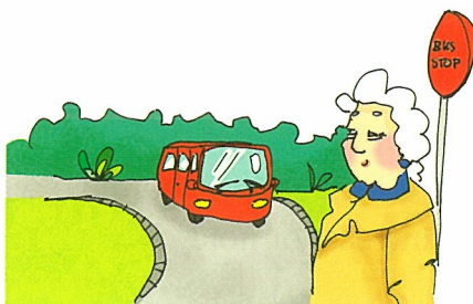
waiting for a bus (not reading a newspaper)