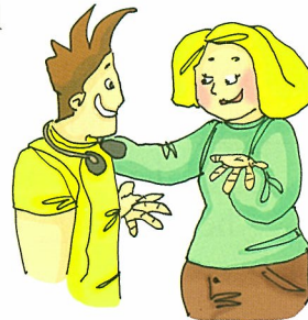
talking to his mother (not listening to music)